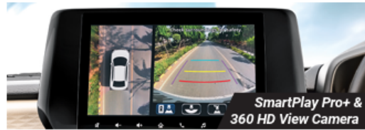
SmartPlay Pro+ & 360 HD View Camera