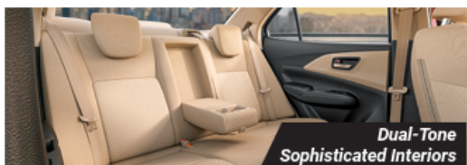
Dual-Tone Sophisticated Interiors