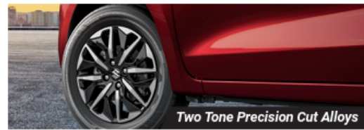
Two Tone Precision Cut Alloys