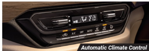
Automatic Climate Control