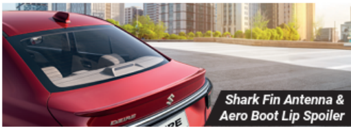
Shark Fin Antenna & Aero Boot Lip Spoiler