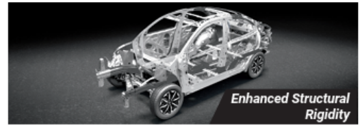
Enhanced Structural Rigidity