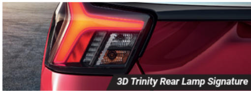
3D Trinity Rear Lamp Signature