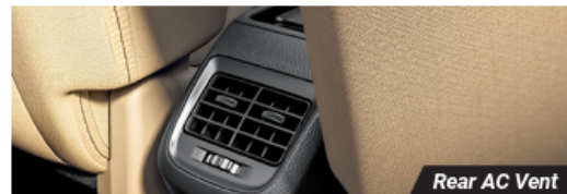
Rear AC Vent