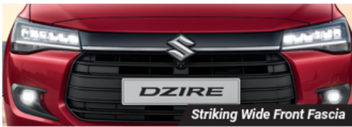
Striking Wide Front Fascia

It's only human to desire a lifestyle beyond the ordinary. Whether navigating city streets or embarking on weekend getaways, the Dazzling-New Dzire offers standout features, adding to its new, dynamic appeal. Its Progressive Sleek Design, with Striking Wide Front Fascia, Sleek Line LED DRLs, and LED Crystal Vision Lamps bring a seamless blend of function and fashion. It's perfect for those seeking luxury and practicality in their everyday journeys.