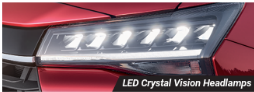
LED Crystal Vision Headlamps