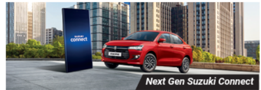
Next Gen Suzuki Connect