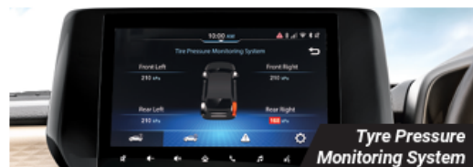
Tyre Pressure Monitoring System